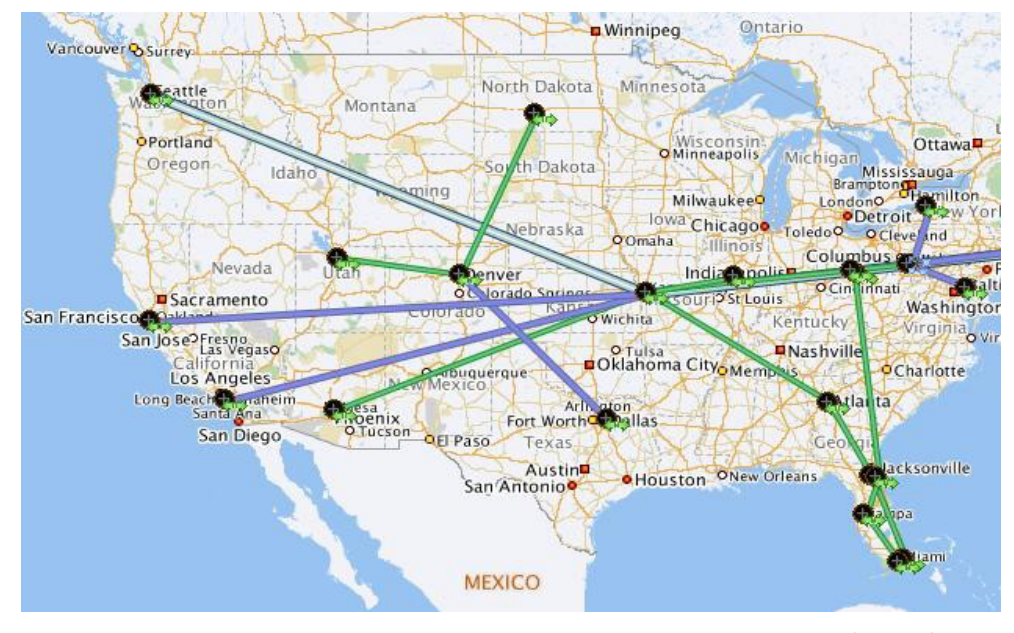
Figure 2: Optimize all modes and across all geographies, determining the right course of action for all orders and shipments based on cost, service level and asset availability.