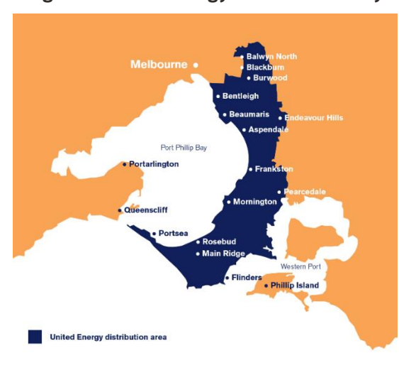
Figure 1: United Energy's service territory