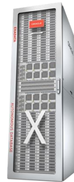
Oracle Exadata Database Machine X9M-8

Exadata is the most thoroughly tested and tuned platform for running Oracle Database.