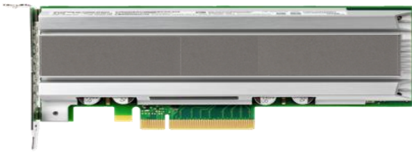
Figure 3. Flash Accelerator PCIe Card

These are real-world end-to-end performance figures measured running SQL workloads with standard 8K database I/O sizes inside a single rack Exadata system. Exadata's performance on real Oracle Database workloads is orders of magnitude faster than traditional storage array architectures, and is also much faster than current all-flash storage arrays, whose architecture bottlenecks flash throughput.