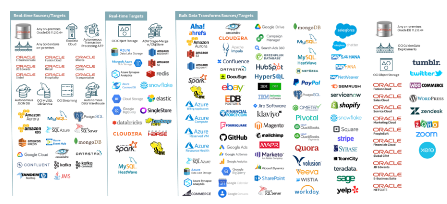
Figure 1: OCI GoldenGate supports 100s of connectors across clouds, databases, technologies, and application services.

OCI GoldenGate connects to 100s of databases, data stores, messaging services, applications, internet business services, and more. See the <a href="GoldenGate">GoldenGate</a> and <a href="Data Transforms">Data Transforms</a> documentation for the latest connectors.