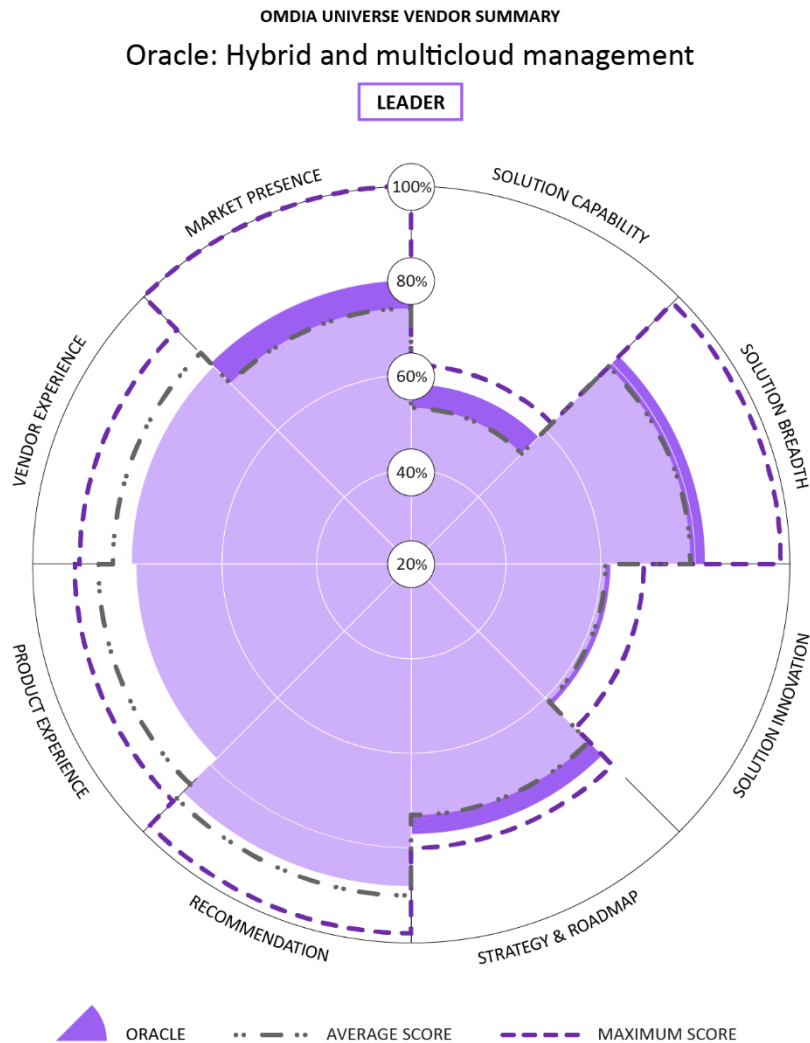
Figure 9: Omdia Universe ratings: Oracle