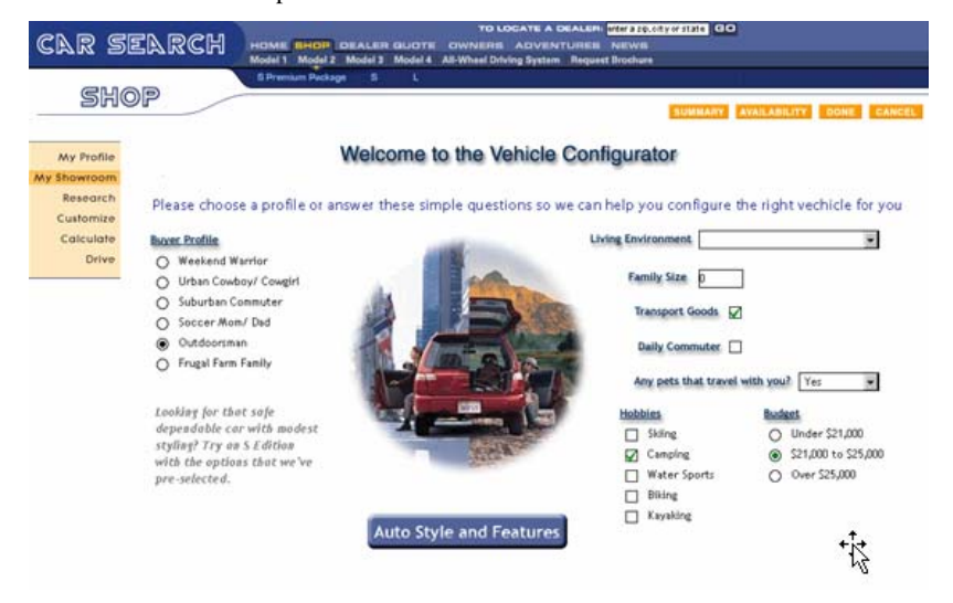
Figure 2: Oracle Configurator guides the customer to the best selection

With Oracle Configurator, customers can configure complex custom products and services that meet their needs. Through an interactive guided selling session, customer requirements are gathered and mapped to a set of product options. As the customer provides information, follow-on questions and options are focused to include only the choices that fulfill customers' requirements. During the configuration session, the interactive engine provides real-time feedback, ensuring that valid solutions are provided.