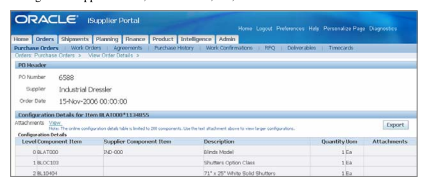
Figure 4: Configuration Details from the iSupplier Portal

Outsource any level of your configuration to a supplier, and use the iSupplier Portal to quickly and efficiently share configuration details. Use Oracle's Purchasing solution along with Oracle's workflow enabled order fulfillment to automatically open and reserve a requisition to purchase unique configurations from your supplier or contract manufacturer based on your configured sales order. This requisition can be automatically converted into a release against a blanket purchase order, or a new purchase order. Details of the configuration can be communicated quickly and easily through the iSupplier Portal, or via e-mail, fax, EDI or XML.