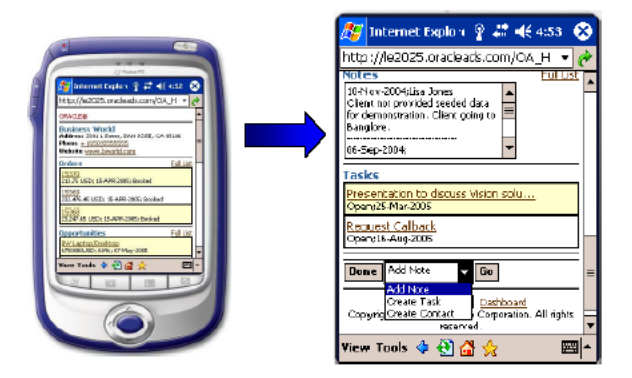
Figure 2: Sales for Handhelds accesses and updates enterprise SFA data via PIM or Web browser

Oracle Sales for Handhelds keep customer information up to date on the road and in your enterprise system. Vital customer information never falls through the cracks, because salespeople can access and update enterprise data wirelessly. Sales for Handhelds uniquely let users access enterprise Sales Force Automation (SFA) information from either a handheld Web browser or a handheld's Personal Information Manager (PIM), such as Microsoft® Outlook.