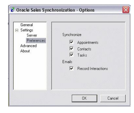
Figure 6: Users have the ability to handle conflicts from every device that allows synchronization