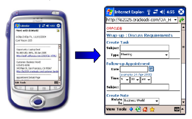
Figure 3: Real-time opportunity information help reps prepare, conduct, and follow up on sales calls

It seems there is never enough time to prepare for an important sales meeting, or to deal with the inevitable follow-up tasks. Oracle Sales for Handhelds makes it easy for mobile sales reps to prepare for their sales call, answer questions during the meeting, and capture and track follow-up items.