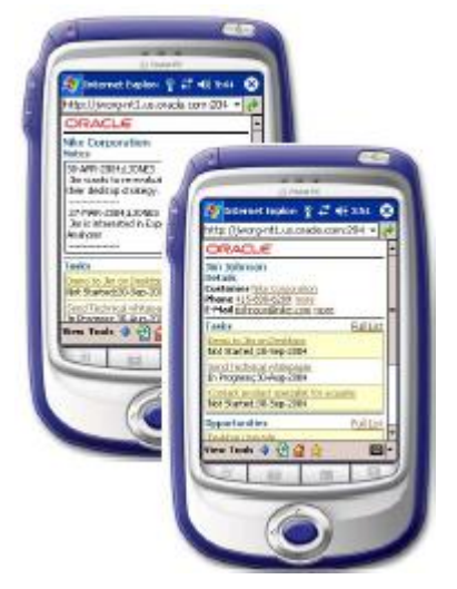
Figure 1: Wireless handheld access to enterprise information makes mobile users more effective

Salespeople on the road need the latest information about customers and deals, even when they are away from laptops and WiFi connections. Oracle Sales for Handhelds turns any supported handheld device into a powerful access point for enterprise information. Sales reps can quickly view and update contacts, appointments and tasks through the familiar interface of their handheld's Personal Information Manager, or use the application in real-time through the handheld's Web browser. On the way to a customer meeting, sales reps can check the latest information about the customer and opportunity. On site, the rep can check the status of a customer order, take meeting notes, and set follow-up items—all right in the meeting. After the rep updates deal status, changes flow into the related sales forecast, ensuring that the sales team and sales management have a unified view of customers, pipeline and orders. With Oracle Sales for Handhelds, your mobile sales force is always informed and in touch.