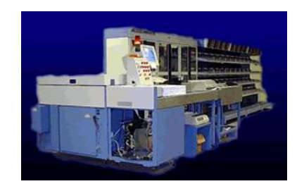
USPS Mail Processing Equipment (MPE) Scanner & Sorter