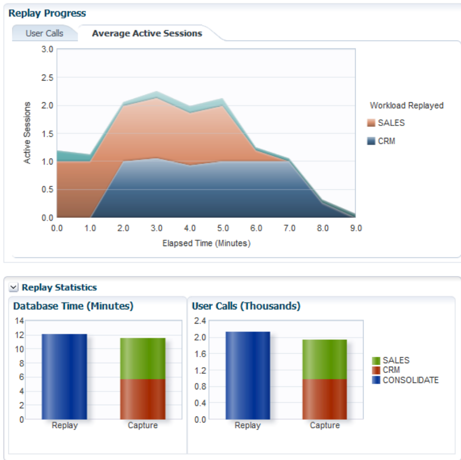
Figure 3. Consolidated Replay of Two Workloads

Figure 3 shows the result of a Consolidated Replay of two workloads.