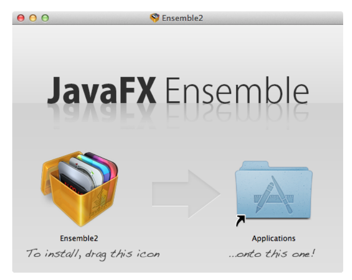
Figure 3: Example of customized appearance of an installable package for OS X

If an applet cannot be converted to a Java Web Start application, developers can explore alternative approaches.