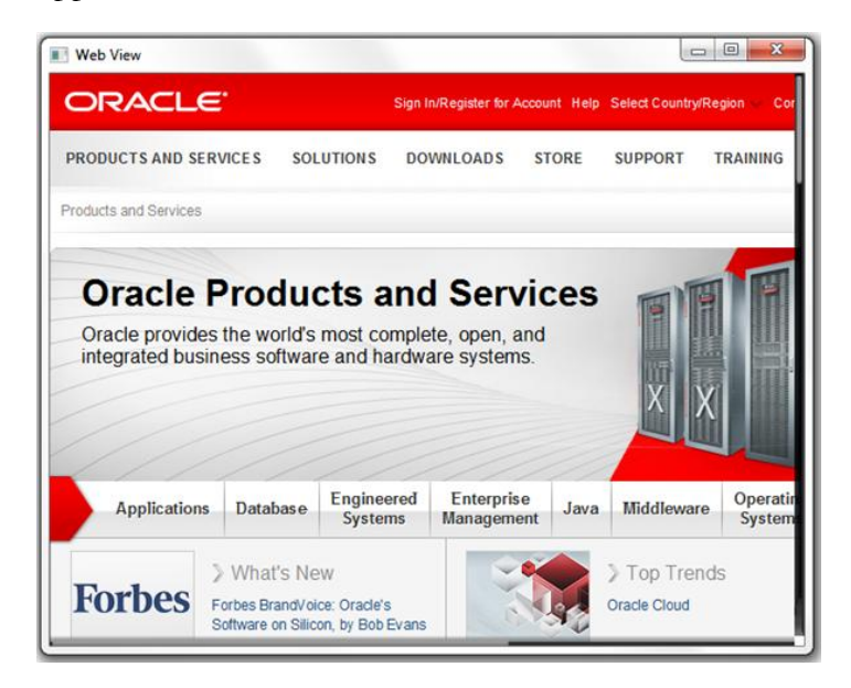
Figure 4: A JavaFX WebView Object in an application

This option is best suited for desktop applications, where the user may not have their own JRE installed and just wants the program to run. For example, it can be used to create standalone native install bundles for applications using JavaFX or Swing user interface technologies, as shown in Figure 3. But it may not be appropriate for server-based applications where an administrator would want full control over the environment.