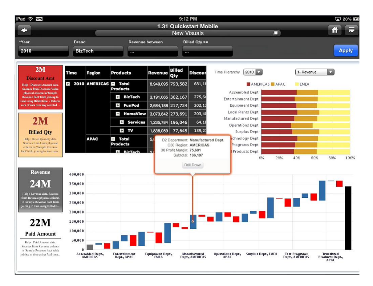
Figure 4: Oracle Exalytics delivers interactive visual analysis to Applie iPad and iPhone.

The visualization and interactivity enabled by Exalytics will also be available on supported mobile devices. With Exalytics, organizations can scale to larger populations of mobile users without extra servers to maintain or content to redevelop, making analytics on Exalytics truly pervasive.