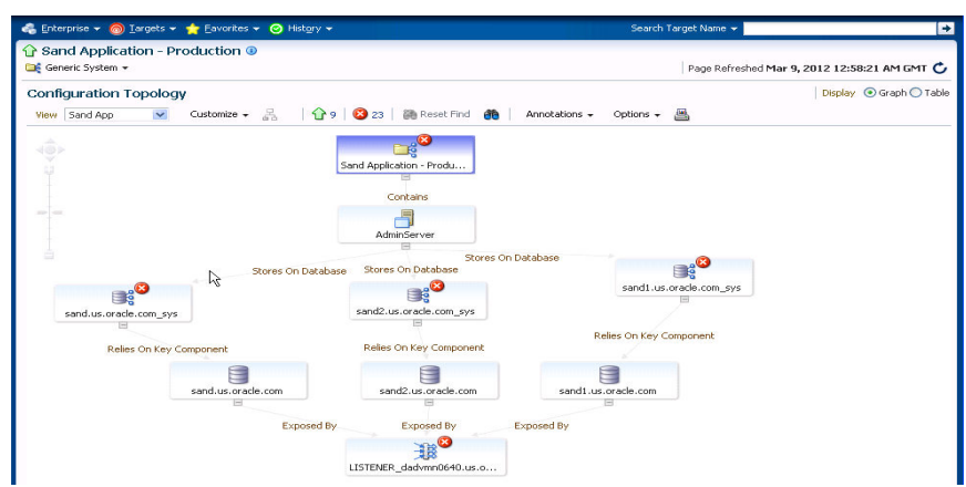
Figure 2. Configuration Topology

The configuration Search capability leverages the deep configuration and relationship information collected by Enterprise Manager. Administrators can use the many out-of-box searches or build and save adhoc searches graphically by leveraging the configuration models and relationships. Relationships are also viewable in the topology viewer. A topology can be used to perform impact analysis prior to making changes or root cause analyses in the case of an issue.