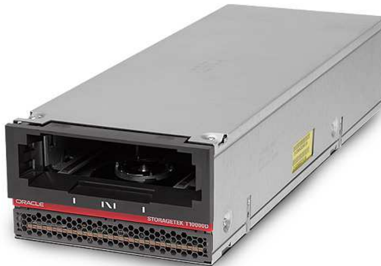
Figure 1 – StorageTek T10000D Tape Drive