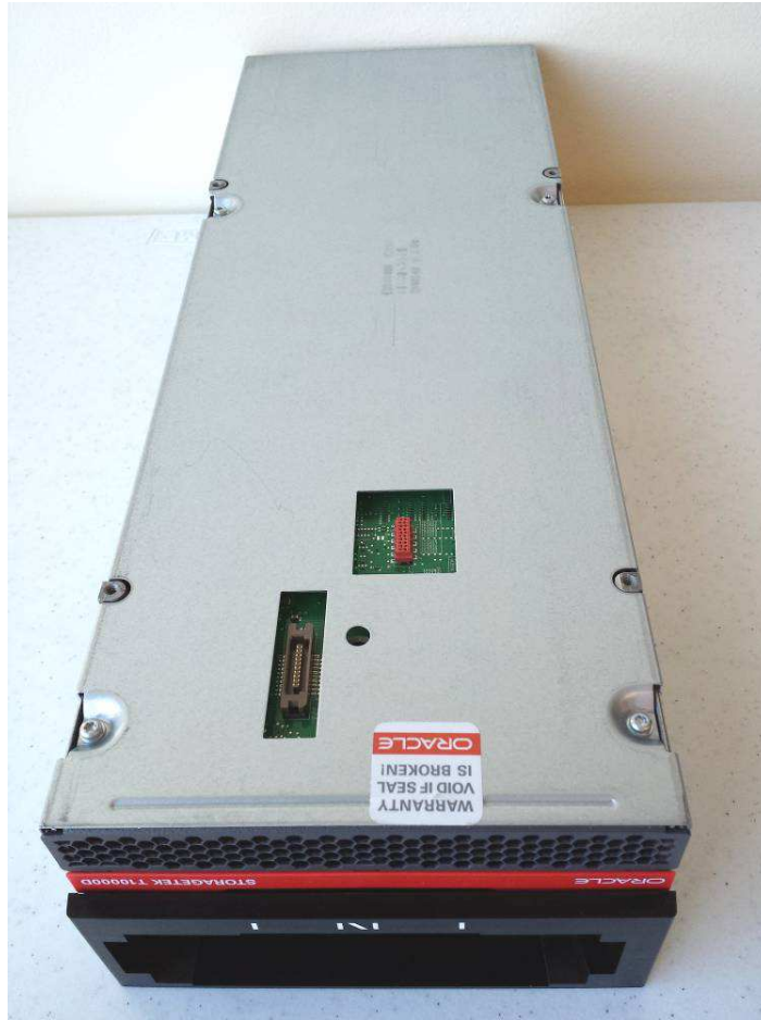
Figure 5 – StorageTek T10000D Tape Drive (Bottom) 15

Table 2 provides a mapping of all of the physical interfaces of the StorageTek T10000D Tape Drive listed above to their respective FIPS 140-2 Logical Interfaces. The functionality and logical interface mappings of these physical interfaces do not change between Approved modes.