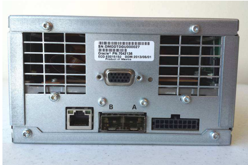
Figure 4 - StorageTek T10000D Tape Drive (Rear)

The bottom of the StorageTek T10000D Tape Drive (Figure 5) provides one additional physical interface; the Operator Panel Port. This port is used to provide general module status as well as additional control input access when the drive is rack-mounted.