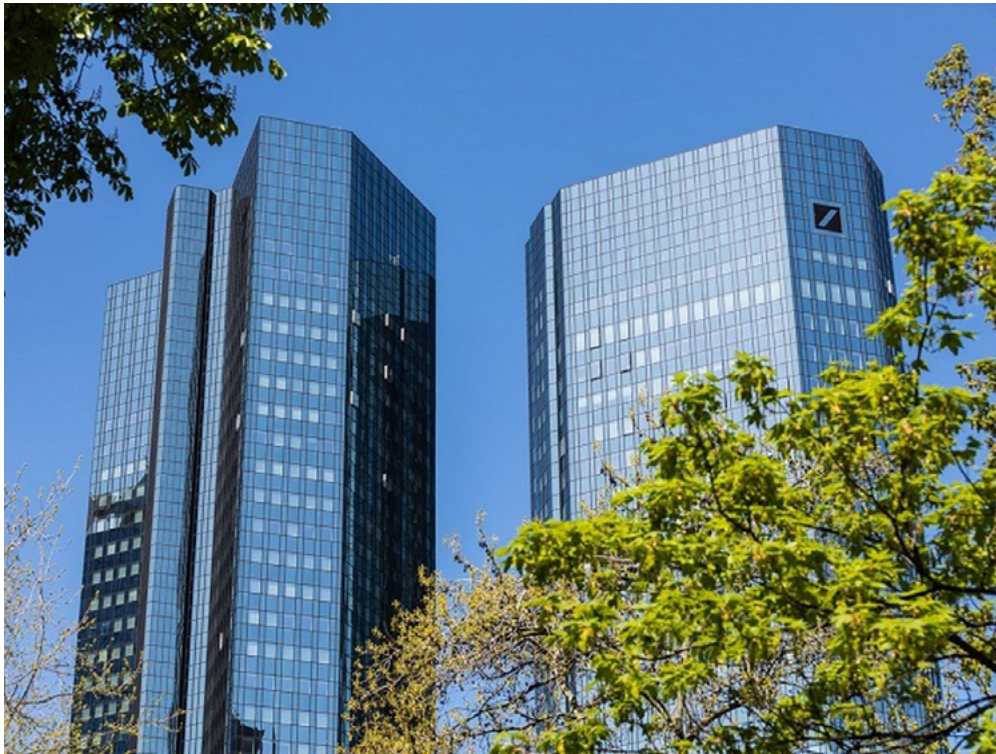
Figure 1. Deutsche Bank Headquarters in Frankfurt, Germany