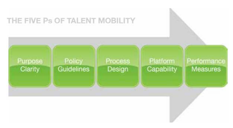
Figure 1. The five key dimensions for a successful internal mobility program