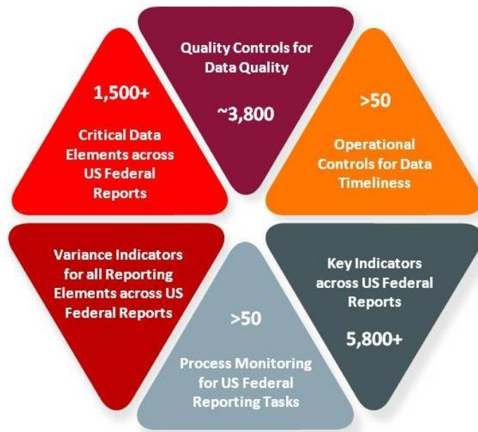
Figure 1: Oracle Financial Services Data Governance for US Regulatory Reporting Content

Figure 1 summarizes the content prepackaged in Oracle Financial Services Data Governance for US Regulatory Reporting. The critical data elements are used across the regulatory reporting process. Quality controls provide the ability to monitor the quality, accuracy, and integrity of data used for regulatory reporting purposes and operational controls provide the ability to monitor operational processes for availability and timeliness of data flowing through complex computations. Key indicators help compare values, perform validations, and monitor trends of values that are used in regulatory reports. A process monitoring plan tracks and monitors tasks for regulatory report submissions.