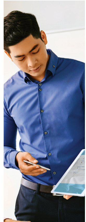
Digitize Foundational Capabilities and Transform Corporate Banking

Oracle offers prebuilt interfaces with several market systems. It enables faster settlement through SWIFT network. Offers easy interfacing with credit bureau, agency systems and third party feeds and is fully compliant with clearing systems like Fedwire and US ACH.