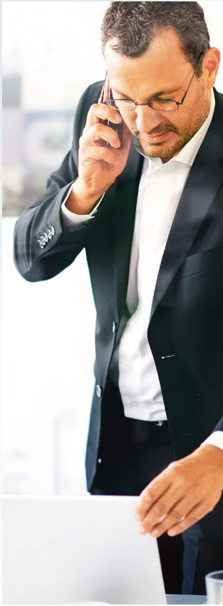
Connected Banking is about Owning the Ecosystem

Digitization is transforming corporates into hyperscale global business that have great financial sophistication. If banks are to stay relevant they need to enable connected corporate banking ecosystem.