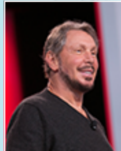
Lawrence J. Ellison Founder, Executive Chairman of the Board, and Chief Technology Officer