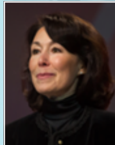
Safra Catz Chief Executive Officer