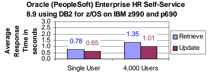
Figure 1: Average Response Times

The benchmark measured client response times for 4,000 concurrent users. The standard database composition model represents a medium-sized company profile. The testing was conducted in a controlled environment with no other applications running. The tuning changes involved ICE Resolution Id: 734685. This will be generally available in a future update. The goal of this Benchmark was to obtain baseline results for PeopleSoft HRMS 8.9 self-service transactions with DB2 for z/OS on IBM z990 and pSeries Servers.